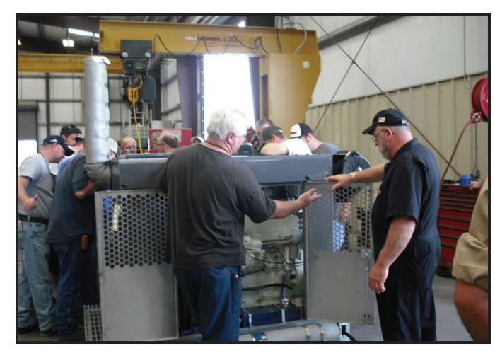
2011 Tankerman Services Group training in Sulphur, LA.