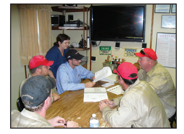
The crew of the M/V NED MERRICK.