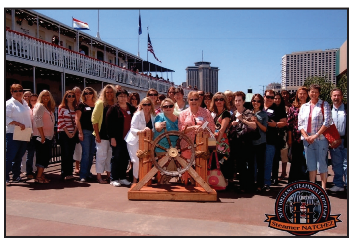
The spouses of our mariners who attended the April session of the 2012 Vessel Officer Workshop pose in front of the Steamboat Natchez in New Orleans.