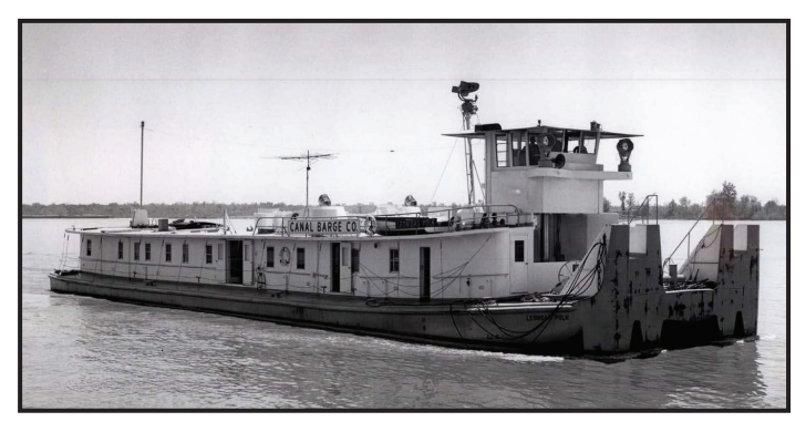
The M/V LEONIDAS POLK