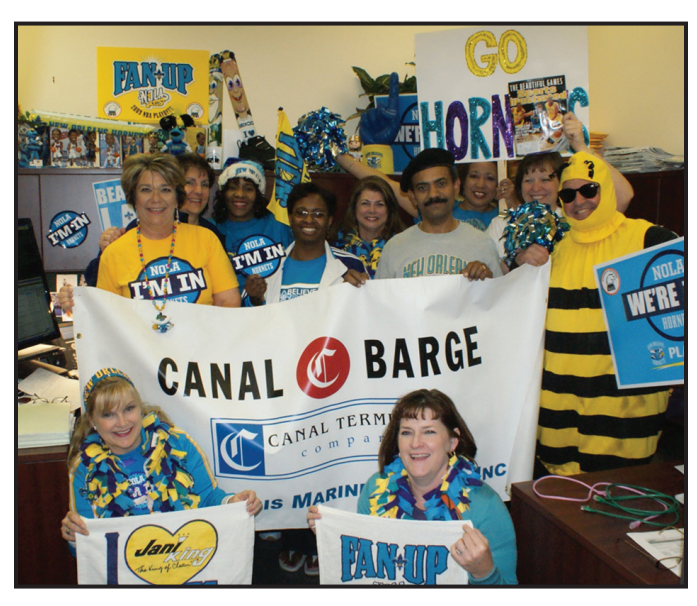
The CBC New Orleans office shows its support for the Hornets.