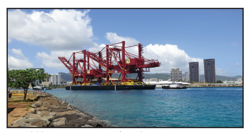
CBC's new deck barge OCEANUS comes into Hawaii from South Korea carrying cranes.